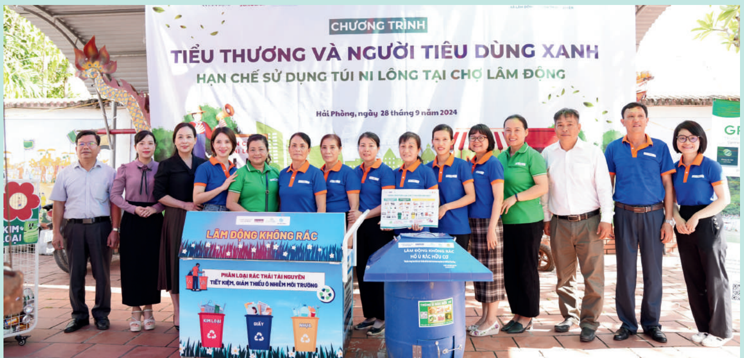
The Club representative received organic composting and recyclable waste collection models from DSCS, the Commune People’s Committee, and GreenHub and committed to implementing the models