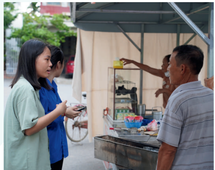
Volunteers conducting KAP surveys with consumers at Lam Dong Market