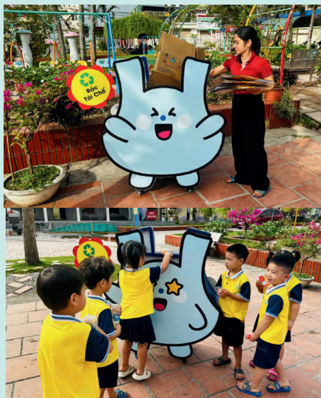
Students and Teachers using the recycling bin model