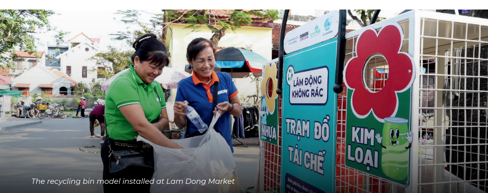
The recycling bin model installed at Lam Dong Market