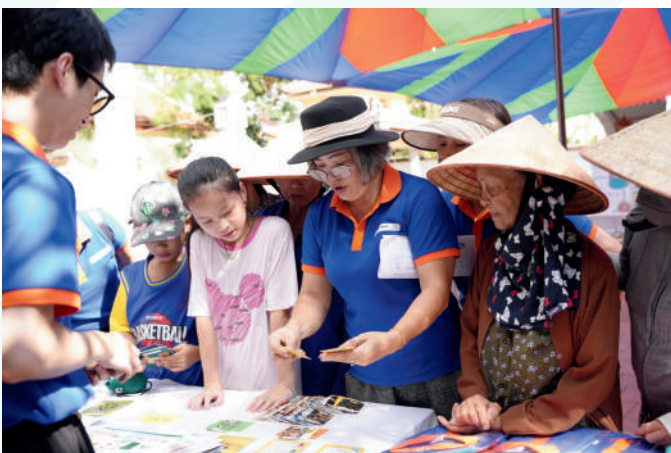
Residents and club members taking part in activities to learn about waste separation