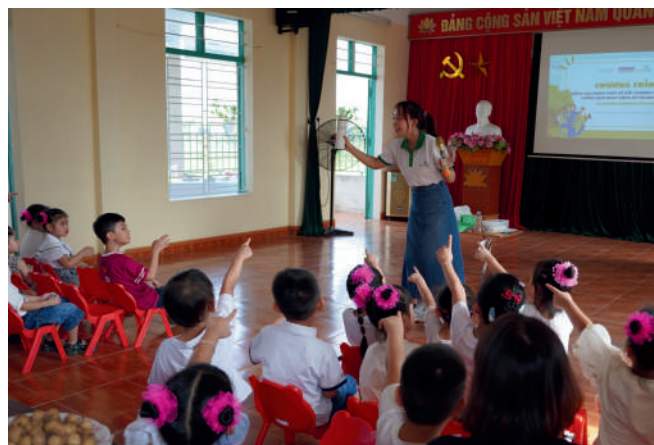
Students participating in activities to learn about the harmful effects of single-use plastic on health and the environment