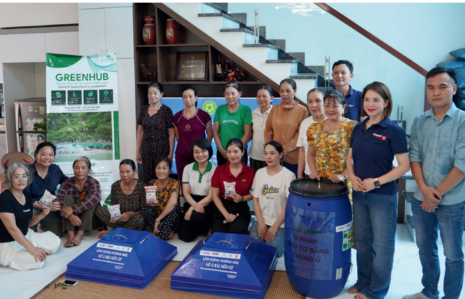
Representatives from DSCS, the Lam Dong Commune People's Committee, and GreenHub presenting 10 compost bins and pits to the pilot households in Hau Village

The pilot process was closely monitored and evaluated to ensure efficiency and feasibility. Based on the positive results from the pilot, the composting model using bins and pits was selected for wider implementation. This method is well-suited to the local conditions, easy to apply, and delivers clear, tangible results.