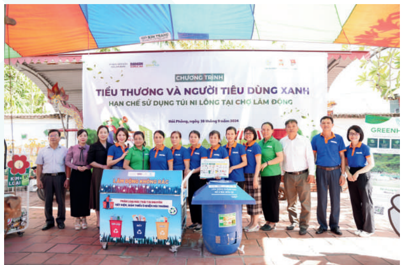
The club received the models from the Lam Dong Commune People's Committee, DSCS, and GreenHub

To support the club’s activities, the project handed over communication materials, recycling collection models, and organic waste management systems for households.