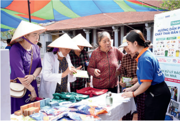
Traders were informed about reusable products to replace plastic bags during the event