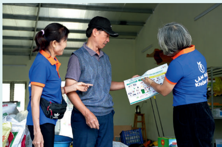
Club members educating and guiding residents on household waste sorting

As of now, all residents in Lam Dong Commune have been informed about the Regulation for Separating Household Solid Waste, with 43.4% of households (854 households) receiving in-person guidance and instructions at their homes. This impressive figure, reflects the club's determination to create a mindset shift in the community.