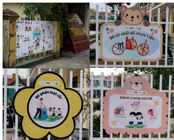
Communication Posters installed at Lam Dong Kindergarten

In collaboration with the ZHub program, Lam Dong Kindergarten was equipped with posters and recycling bins featuring vivid, visual images, helping students easily recognize and practice waste separation.