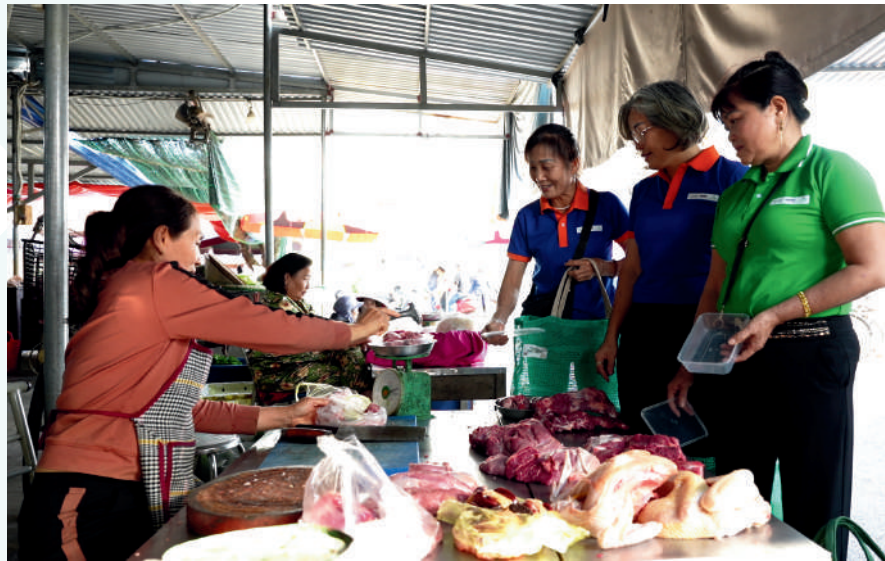
Club members shopped without plastic bags and spread the message to vendors at Lam Dong Market

The club's continuous efforts have contributed to building a green living movement, helping Lam Dong Market gradually become a model for plastic waste reduction.