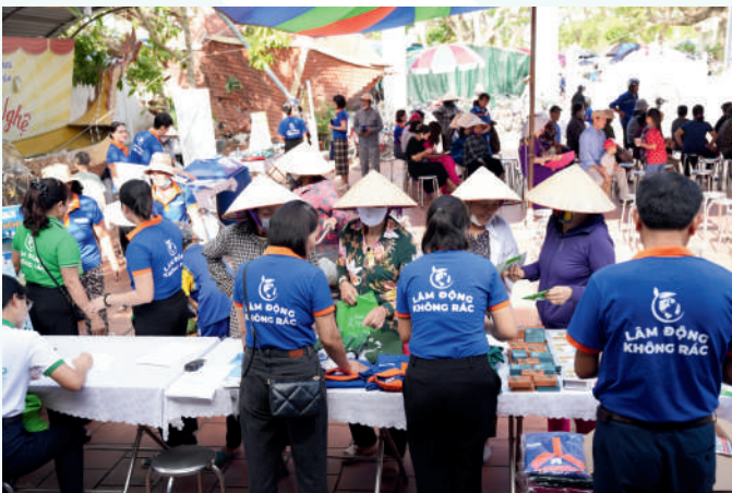
Residents and club members participating in activities at the Recycle Waste for Green Gifts Station

During the event, attendees were invited to participate in various activities , such as: