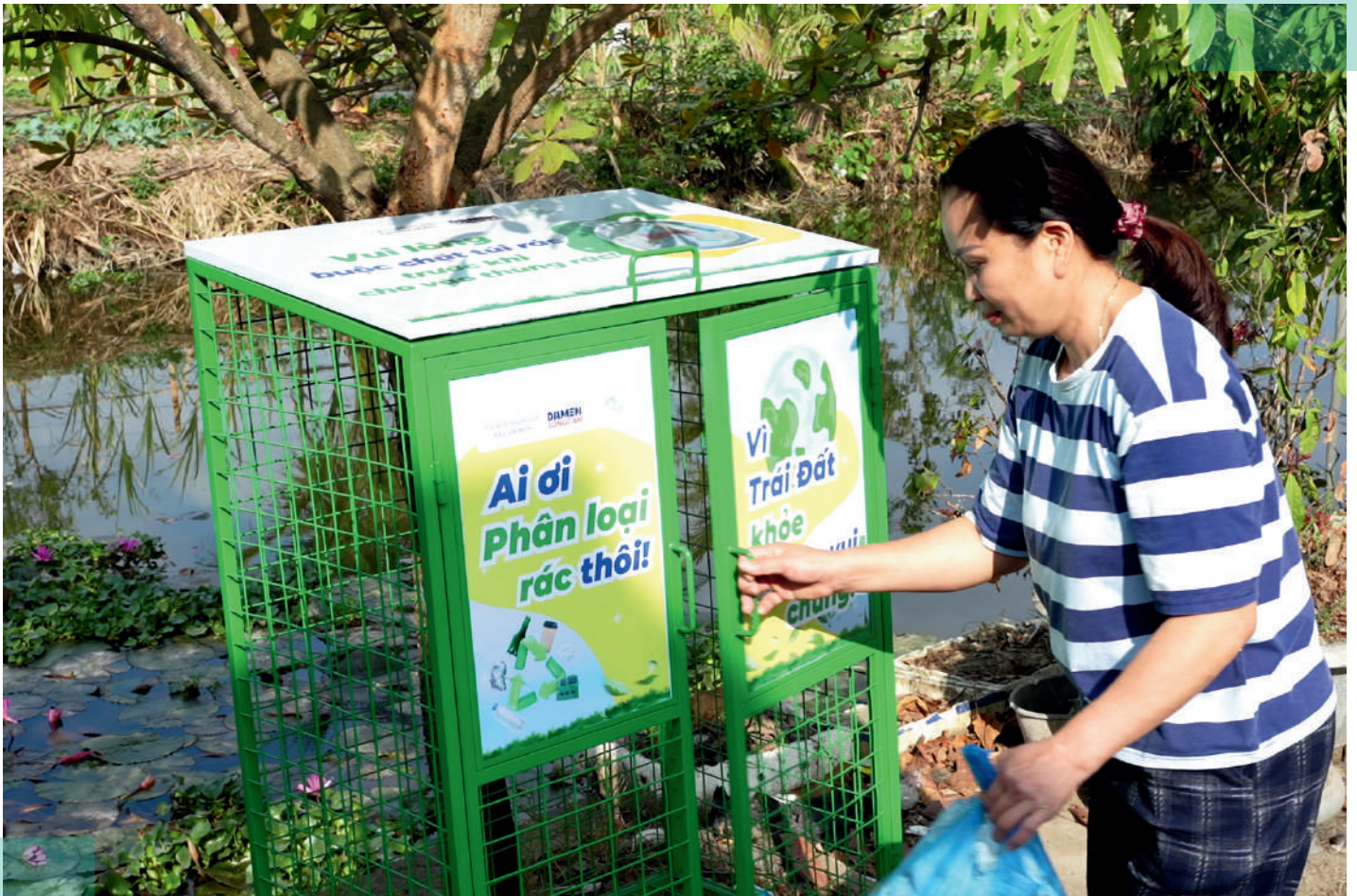
A pilot program for centralized waste bins