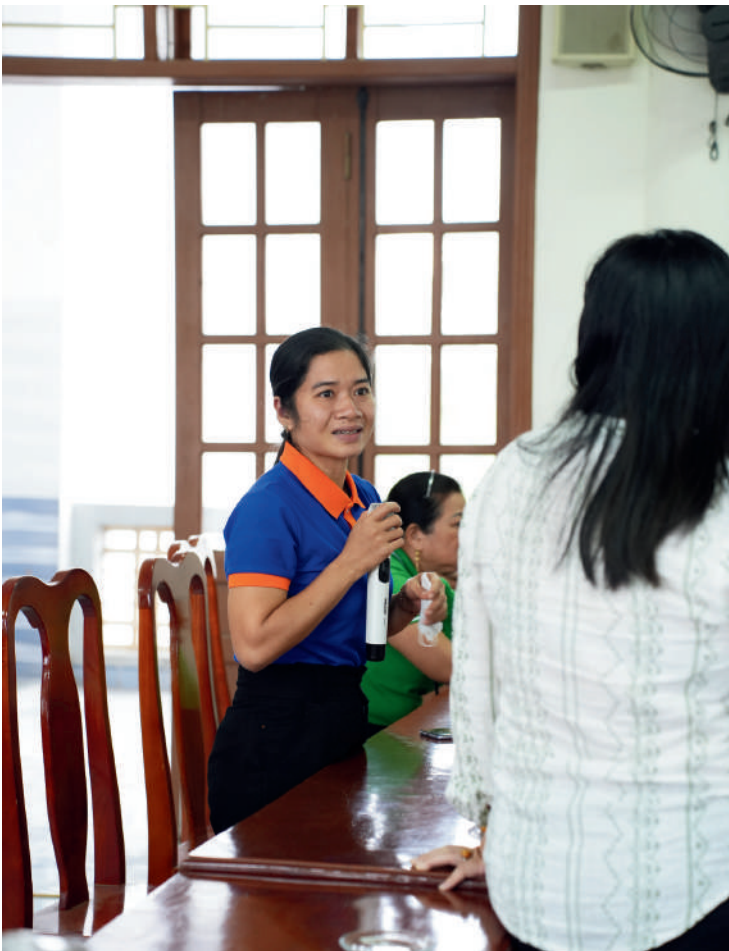
Members of the "For a Zero Waste Lam Dong" Club participating in the training

The project also organized a training session to guide participants on the proper use of compost bins and pits, ensuring effective waste management.