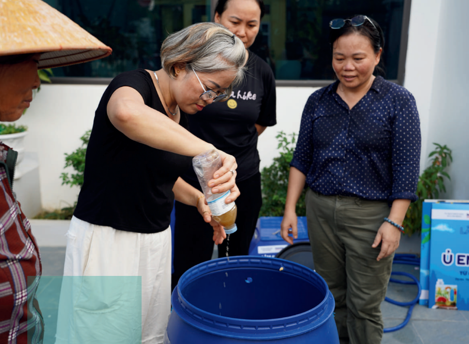
Members of the “For a Zero Waste Lam Dong” Club taking part in the training on composting organic waste using bins and pits