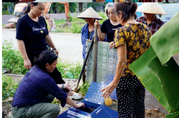
Mrs. Lan actively participated in the project's training sessions