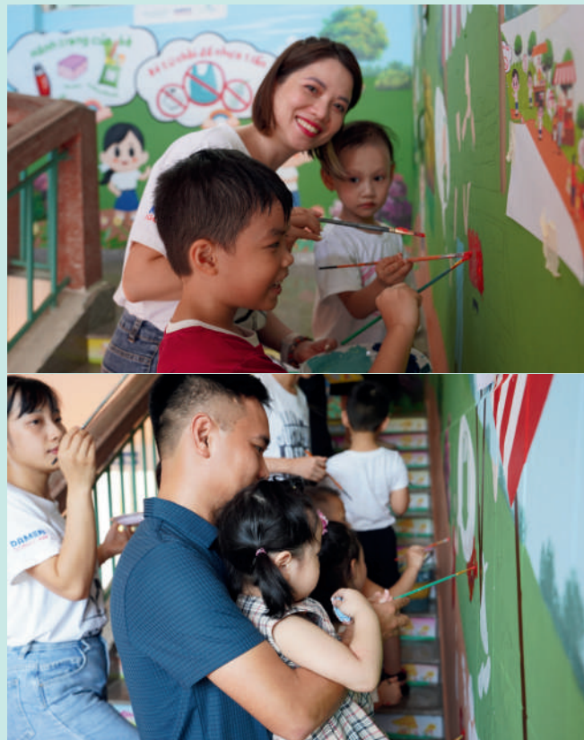
DSCS employees' families, teachers, parents, and students taking part in the mural painting activity

The event offered an opportunity for students and their families to engage in activities exploring plastic waste and alternative solutions. Additionally, mural painting helped spread the message of environmental protection to students and their families.