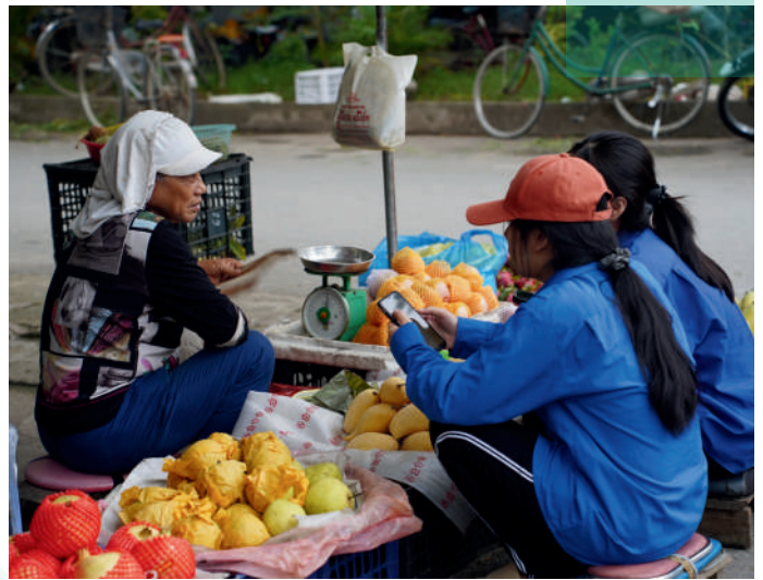
Volunteers conducting KAP surveys with traders at Lam Dong Market

Based on the survey results, the project planned follow-up activities such as awareness-raising events, technical training sessions, the provision of eco-friendly alternatives, and communications through posters, murals, and local loudspeakers. These efforts aim to turn Lam Dong Market into a model for reducing plastic waste.