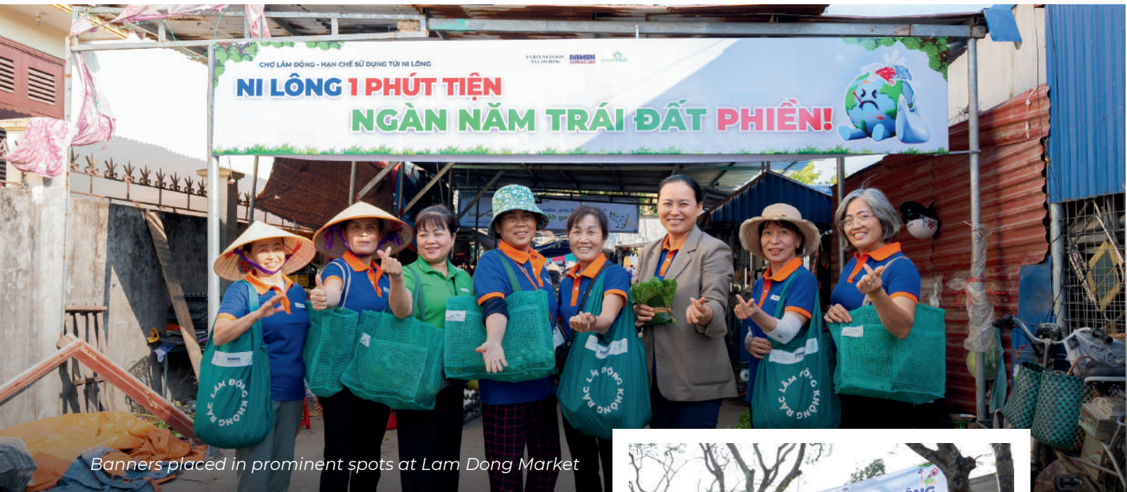
Banners placed in prominent spots at Lam Dong Market

The communication products and activities included: