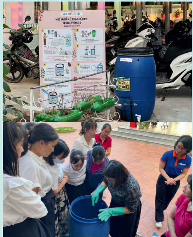
Lam Dong Kindergarten's teachers were trained on how to manage organic waste using composting bins

Lam Dong Kindergarten has begun implementing an organic waste composting model from food waste, with guidance and support from the project. This method not only reduces household waste but also generates natural fertilizer to nourish the school's green gardens.