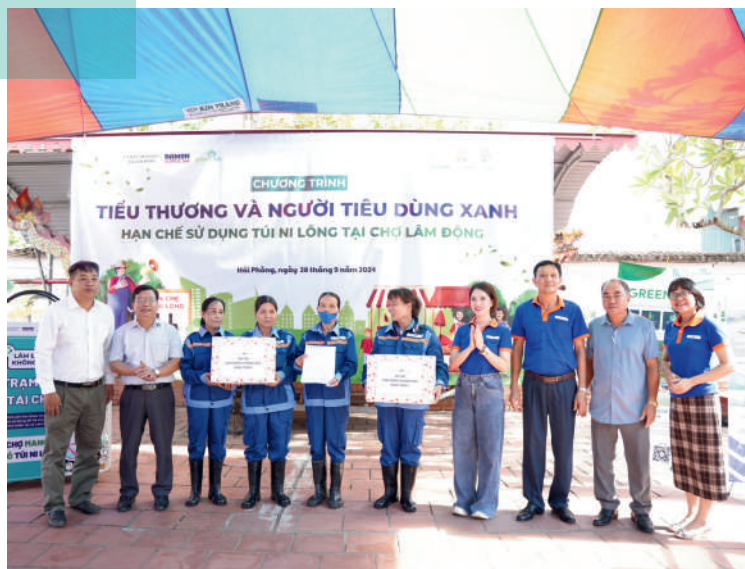
Representatives from DSCS, the Lam Dong Commune People's Committee, and GreenHub presenting protective gear and labor insurance to the waste collection team