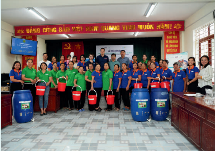
DSCS presented 50 compost bins and pits to 50 households in Lam Dong Commune

With the support of DSCS, GreenHub distributed over 50 compost bins and pits for food and organic waste to households in Lam Dong Commune on October 27, 2024.