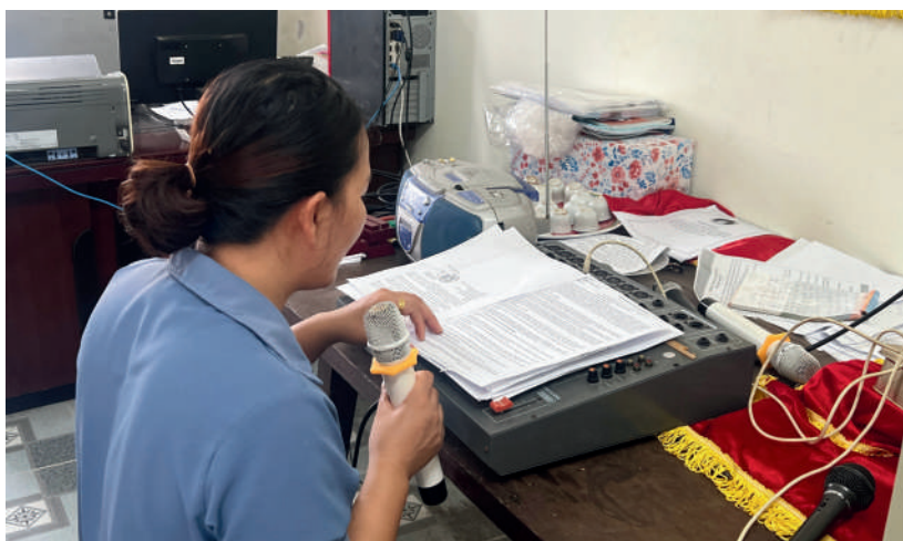
Local cultural officers conducting monthly radio programs

This creative model not only serves as a part of the recycling waste segregation initiative by the “For a Zero Waste Lam Dong” Club, but also conveys the message of encouraging the public to use reusable bags/baskets instead of plastic bags.