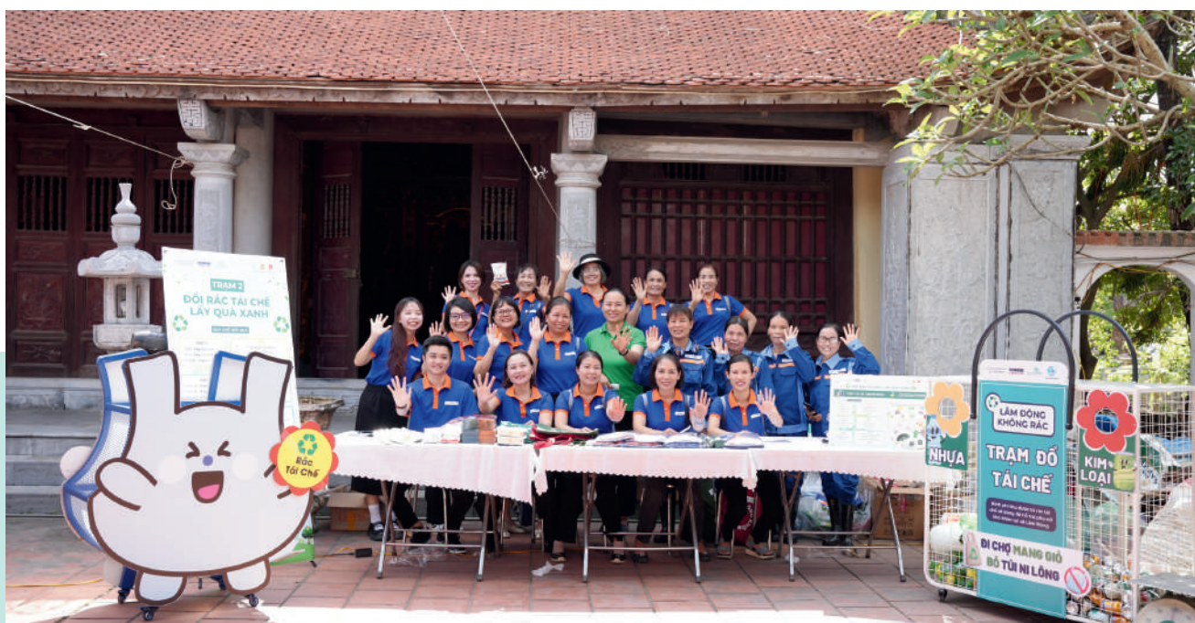
The “For a Zero Waste Lam Dong” Club at the event “Green Traders and Consumers – Reducing Plastic Bag Use”

Implement Household Food and Organic Waste Management