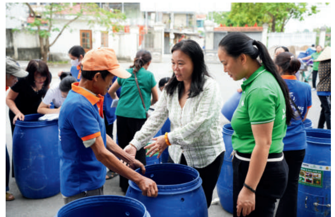
Residents were guided by experts on how to properly use the compost bins