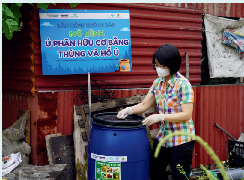
GreenHub conducted surveys of the pilot models for organic waste management using compost bins in Hau Village

The pilot process was closely monitored and evaluated to ensure efficiency and feasibility. Based on the positive results from the pilot, the composting model using bins and pits was selected for wider implementation. This method is well-suited to the local conditions, easy to apply, and delivers clear, tangible results.