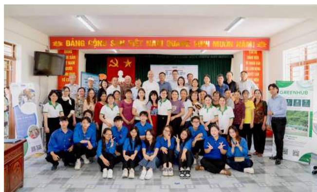
Project Launching ceremony on September 23, 2023

At the same event, there was the signing ceremony of the Memorandum of Cooperation between Damen Song Cam Shipbuilding Co., Ltd. (DSCS), Center for Supporting Green Development (GreenHub) and Lam Dong Commune People's Committee, demonstrating the commitment in the tripartite cooperation relationship, promising that the project's goals and four components are implemented effectively.