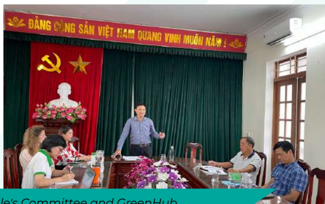
Meeting between DSCS, Lam Dong Commune People's Committee and GreenHub to develop plan and agree on project components in August 2023.