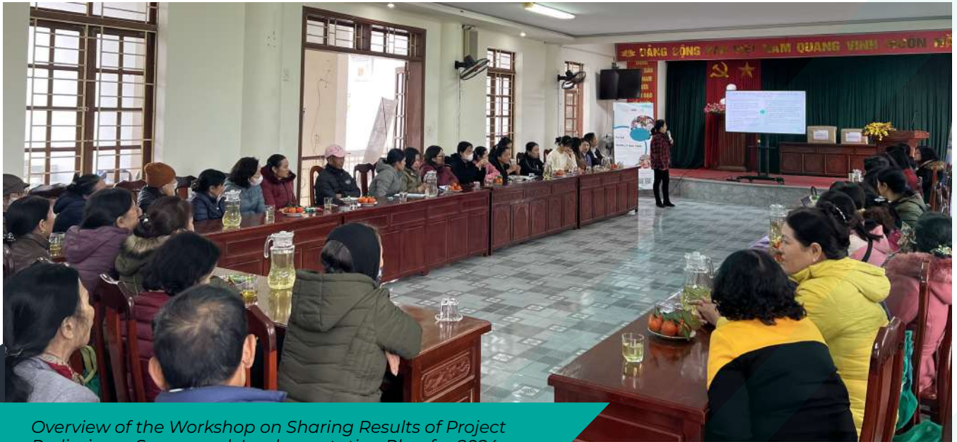
Overview of the Workshop on Sharing Results of Project Preliminary Survey and Implementation Plan for 2024

On December 20, 2023, the “Workshop on Sharing Results of Project Preliminary Survey and Implementation Plan for 2024” took place in Lam Dong commune, Hai Phong city.