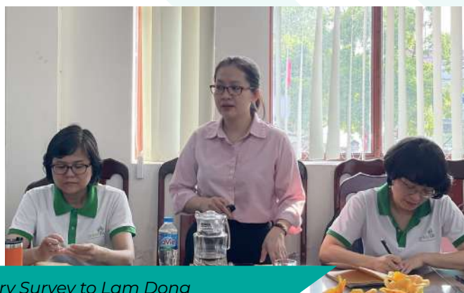
GreenHub presented results of project's Preliminary Survey to Lam Dong Commune People's Committee and representative of local people in November 2023