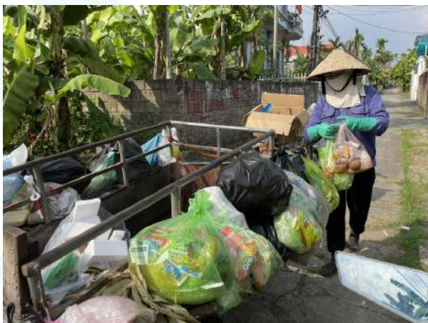
A self-construct tow cart of waste collector for waste collection

The waste flow in Lam Dong commune includes identifying main waste sources, surveying waste collection and transportation routes from waste sources in the area to the waste station, finding out the waste leaking points and reasons.