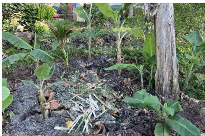
“Banana circles model” that GreenHub implemented in Son dune area, Can Tho city in project “Zero Waste to Mekong River: Pilot Circular Economy model for Floating markets in Can Tho”

Beside communication activities to raise awareness and capacity for localities, pilot models such as: “Zero waste Village”; “Waste separation model and No-plastic bag market”; “Banana circles model in households”... will be consider to set up by GreenHub, local authorities, associations, and waste collect units to determine possibilities and implementation location.