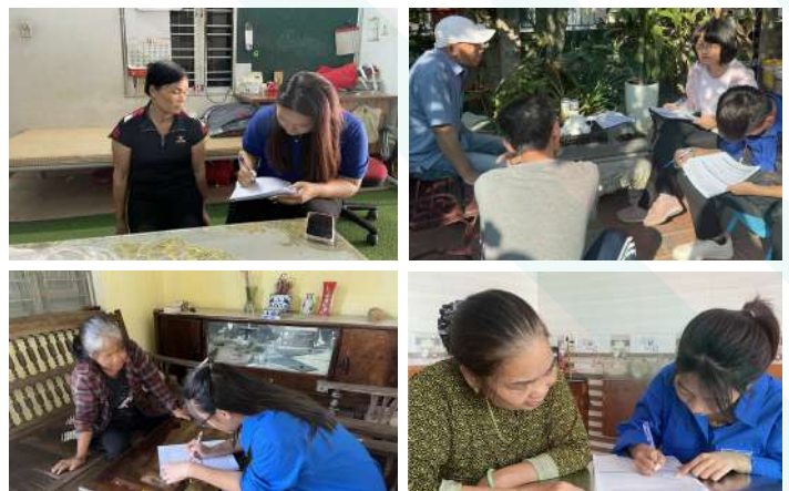
Enumerators survey 205 households about their understanding, attitude, and behaviour of local people toward waste problem

The Knowledge - Attitude - Practice (KAP) survey with 205 typical households in all 4 villages of Lam Dong commune and main waste sources, helps determine the understanding, attitude, and behaviour of local people toward waste problem, thereby proposing solutions to raise awareness and improve the local waste management system.