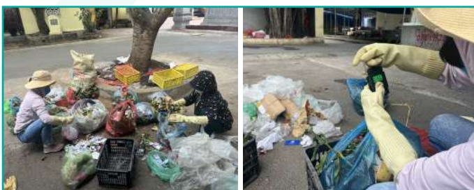
Waste audit at market

Waste at main sources include households; local offices such as the Commune People's Committee and the Clinic; market; Schools and waste stations are audited continuously for 3 days (including weekends with households and waste stations) to determine the amount and composition of waste by weight and volume. This is the basis for understanding the waste discharge habits of local people, identifying main types of waste, and suggesting effective waste management and treatment solutions.