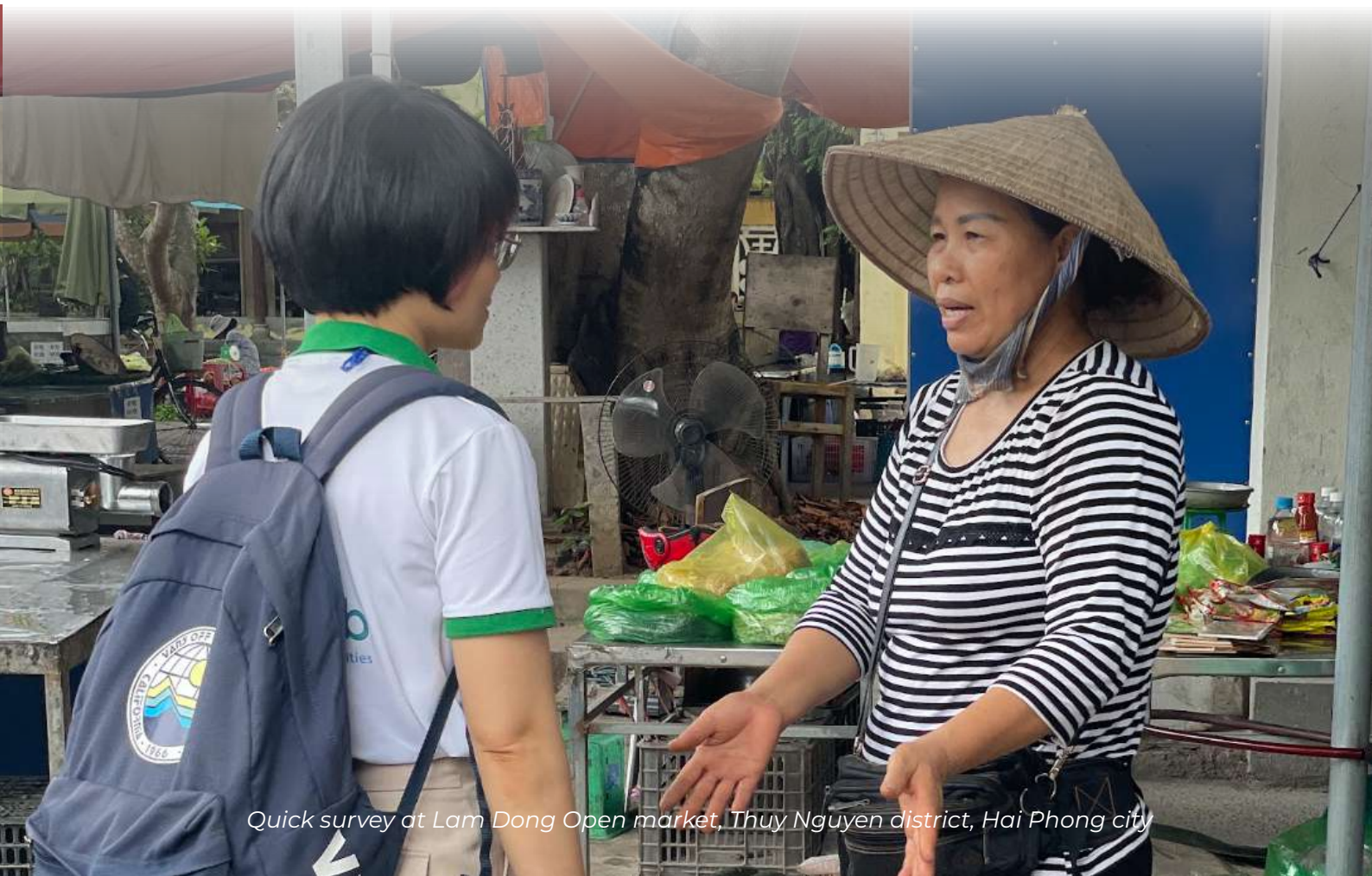
Quick survey at Lam Dong Open market, Thuy Nguyen district, Hai Phong city