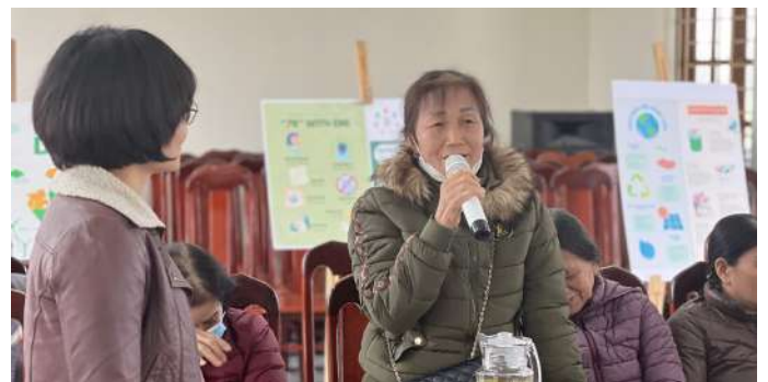
A local resident expressed her opinion about the project's next plan

The seminar ended with the consensus and commitment of Lam Dong Commune People's Committee, local community, and related partners in building the 2024 project implement plan to improve the commune waste management system and improve the quality of life of people in Lam Dong commune.