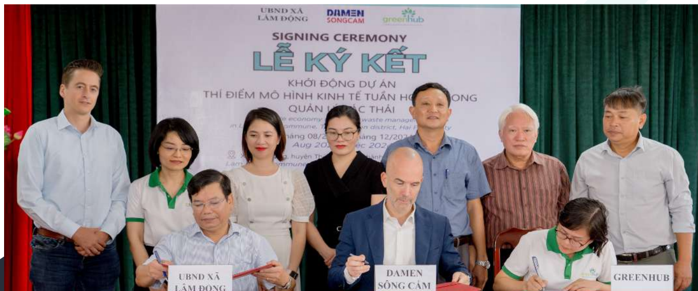
Tripartite cooperation relationship between DSCS, GreenHub and Lam Dong Commune People's Committee Established at the Launching ceremony on September 23, 2023

On September 23, 2023, Damen Song Cam Shipbuilding Co., Ltd. (DSCS), the Center for Supporting Green Development (GreenHub) and Lam Dong Commune People's Committee to organize the Launching Ceremony and Signing Cooperation Agreement. Launching the Project: "Piloting a circular economy model in waste management in Lam Dong commune". This is the first step to support Lam Dong commune to improve the its local waste management efficiency.