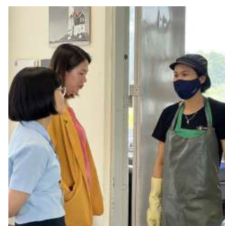
In-depth interview with waste collection workers at DSCS kitchen

The entire survey process was consulted by waste experts and local authorities, compared with secondary documents to ensure accuracy and science, making a strong foundation for the analyse process and solutions in the next phase of the project.