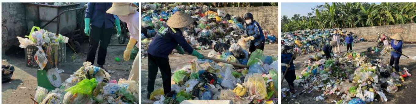
Waste audit at waste station

Interviews with representatives of relevant parties in waste collection chain helped the survey obtain general information and complete data in the waste management chain in Lam Dong commune.