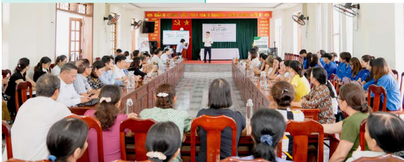
Project Launching ceremony on September 23, 2023

Implemented from August 2023 to December 2024, the Project: "Piloting a circular economy model in waste management in Lam Dong commune" promises a new direction in local waste management, contributing to reducing the amount of waste going to landfills or leaking into the environment, improving the environment and people's living condition through public-private cooperation in waste management.