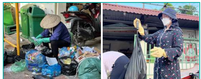
Waste audit at kindergarten