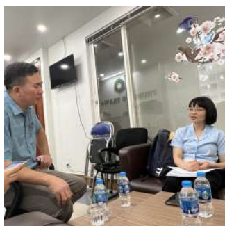
In-depth interview with Phu Hung Trading and Warehouse Service Joint Stock Company (Phu Hung Trawaco)