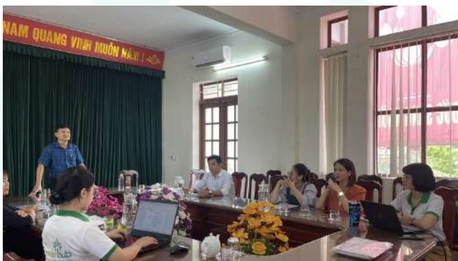
Meeting between DSCS, Lam Dong Commune People's Committee and GreenHub to discuss and develop the project's Preliminary Survey in October 2023