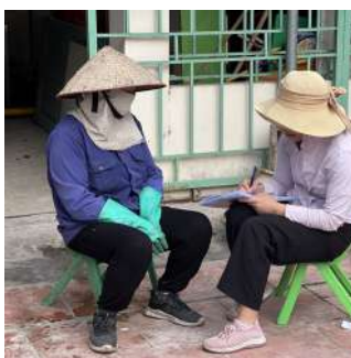
In-depth interview with workers collect waste at Lam Dong commune