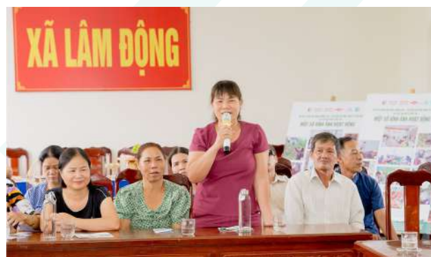
A local resident expressed her opinion

In the ceremony, information about project implementation plans were shared with all levels of government, associations, and local people. In addition, environmental expert, Hai Phong City's Department of Natural Resources and Environment and relevant parties contributed ideas to build project activity plans consistent with local reality and local needs.