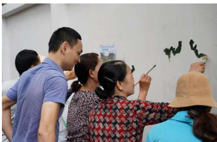
A core group of traders at the Lam Dong market participating in wall painting activity

The series of murals takes viewers on an exciting adventure s to explore "The journey of three plastic bottles". Each painting carries a profound message about the formation, contribution and harmful effects of plastic on the environment and health, thereby leading to environmental protection solutions such as: practicing the 5Rs' rule of waste management (Refuse , Reduce, Reuse, Recycle and Rot), and instructions for composting and composting. The constantant presence of the murals promises to create positive change in the community's attitudes and actions towards the environment and plastic waste.