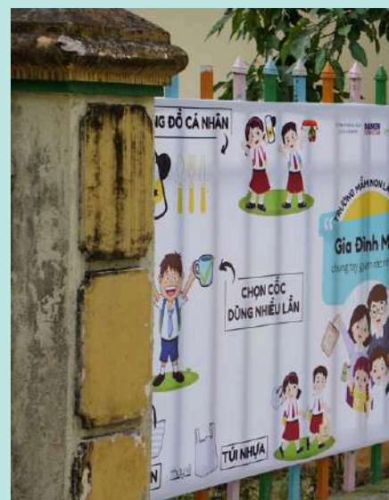
Community communication products were placed at Lam Dong market, People's Committee, kindergartens.