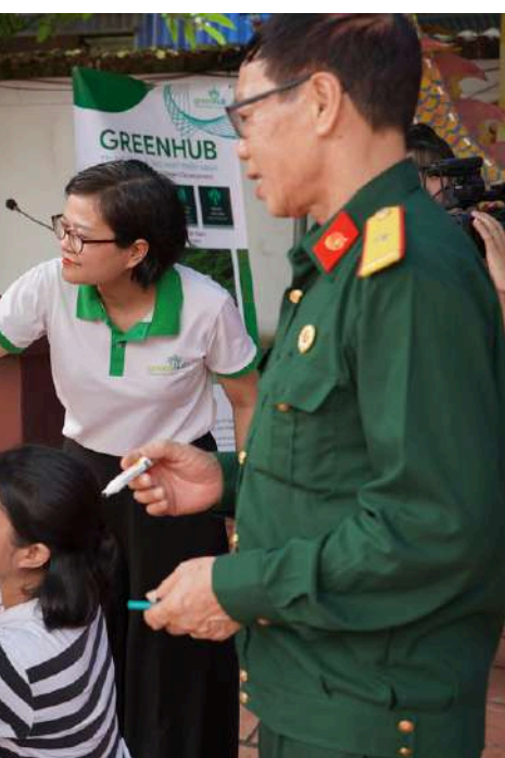
Lam Dong Commune People's Committee, local associations, DSCS and GreenHub signed the commitment on World Environment Day

At the event, GreenHub introduced and handed over to the local government communication products including: