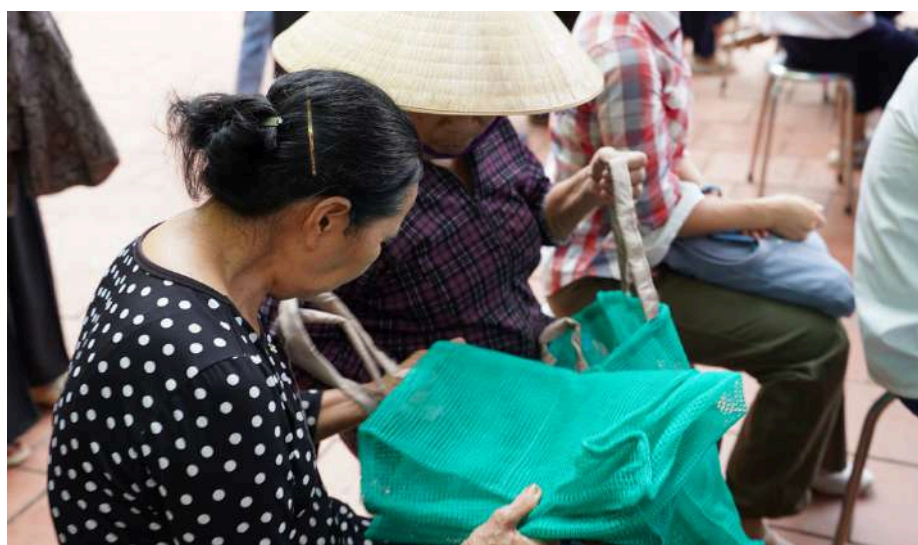
Participants received recycled bags from fishing nets as an alternative to plastic bags within the framework of the model "Lam Dong market restricts the use of plastic bags"

This is an effective tool in the coordination journey between the local government and the project to raise people's awareness of environmental issues and gradually support the implementation of solutions suitable to local needs and realities, towards Zero waste Lam Dong.