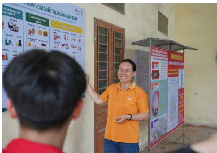
The Commune Women's Union introduce instructions on posters to classify household solid waste