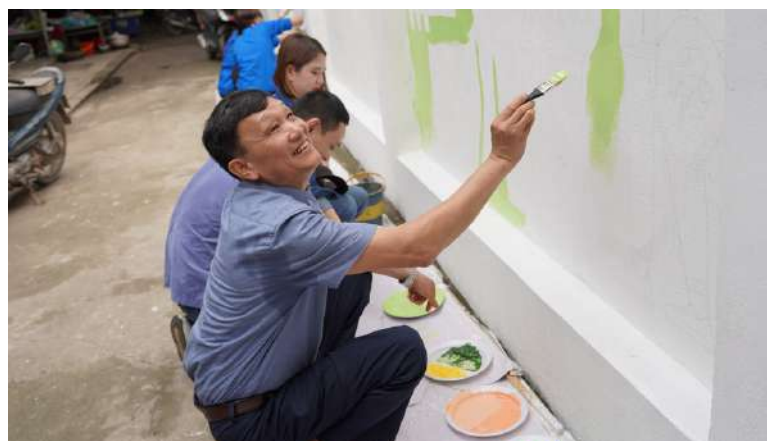
Representatives of Lam Dong Commune People's Committee, DSCS and GreenHub participating in the mural painting activity