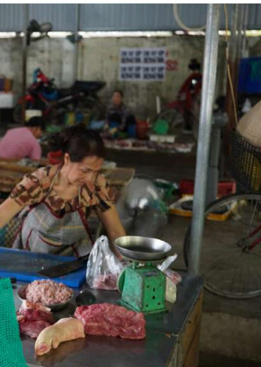
Commune residents now using recycled mesh bags to replace plastic bags for the market

Within the framework of implementing the model, the project donated shopping bags recycled from old fishing nets to replace plastic bags for small business representatives and customers at Lam Dong market. The continuation of this practical activity will contribute to reducing the use of plastic bags and is a key first step in building the model "Lam Dong Market restricts the use of plastic bags".