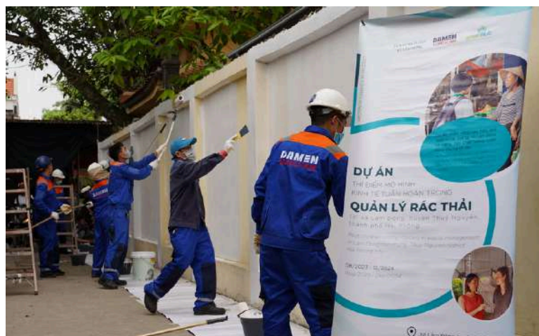
DSCS workers participating in painting murals

On April 20-21, 2024, representatives of the local government and associations of Lam Dong commune, DSCS, GreenHub, a volunteer student team of Vietnam Maritime University and a group of small businesses at Lam Dong market carried out the artistic activity "Painting murals to promote environmental protection", giving a new look to Lam Dong market. This activity is a testament to the efforts of cooperation, mobilizing the participation of the government - businesses and the community to raise awareness and change people's environmental protection behavior.