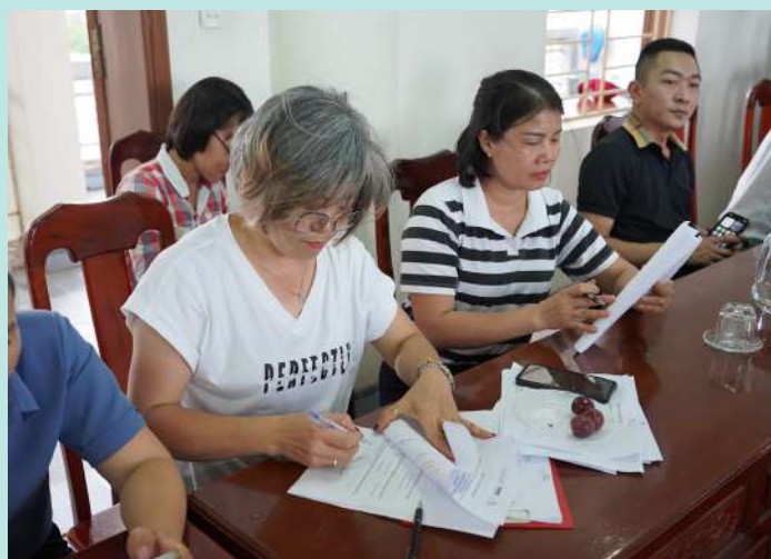
Participants in a knowledge survey after the training

Through the training, Lam Dong residents not only raised their awareness of the importance of organic waste treatment but were also equipped with the knowledge to implement organic waste composting solutions. The next training course on skills to implement organic waste treatment in households will soon be organized according to local needs. This is an important step forward Zero waste Lam Dong.