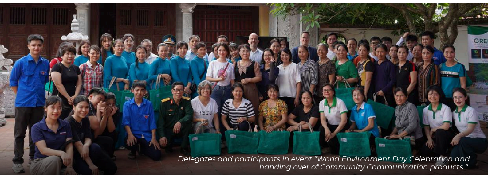
Delegates and participants in event "World Environment Day Celebration and handing over of Community Communication products "

On June 4, 2024 , GreenHub together with DSCS and Lam Dong Commune People's Committee organized the event "World Environment Day Celebration and handing over of Community Communication products "