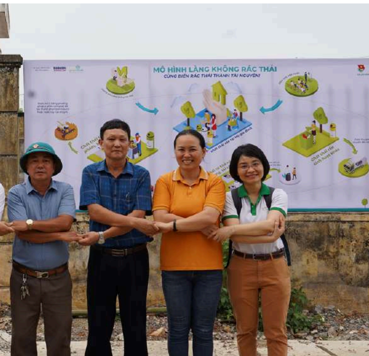
Representatives of Lam Dong Commune People's Committee and local associations received of community communication products from GreenHub at one of village cultural houses