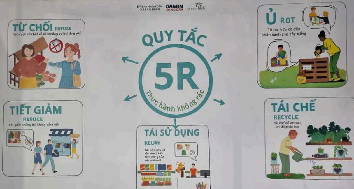
Murals at Lam Dong market after deployment.

The series of murals takes viewers on an exciting adventure s to explore "The journey of three plastic bottles". Each painting carries a profound message about the formation, contribution and harmful effects of plastic on the environment and health, thereby leading to environmental protection solutions such as: practicing the 5Rs' rule of waste management (Refuse , Reduce, Reuse, Recycle and Rot), and instructions for composting and composting. The constantant presence of the murals promises to create positive change in the community's attitudes and actions towards the environment and plastic waste.