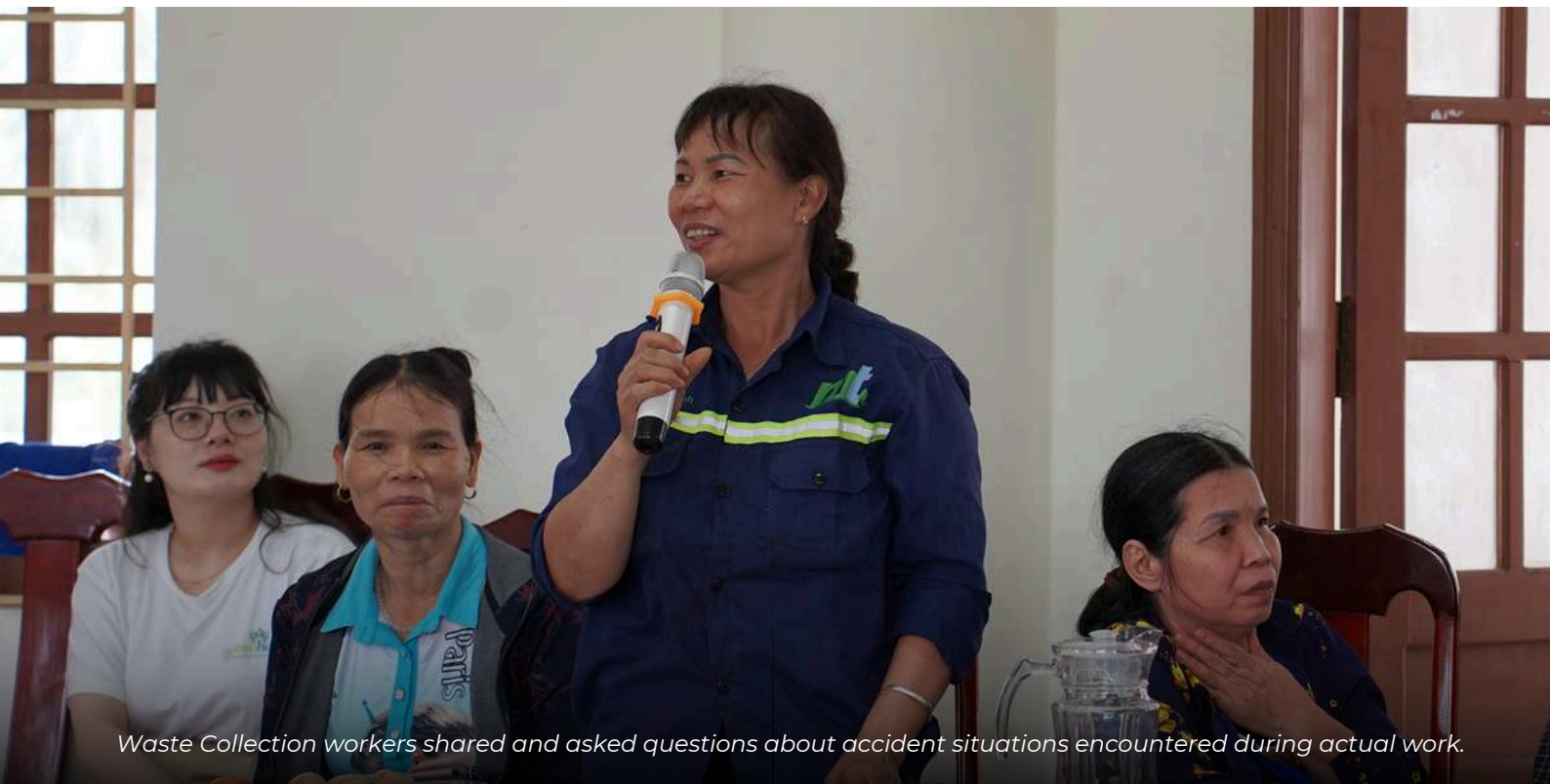
Waste Collection workers shared and asked questions about accident situations encountered during actual work.

Informal waste collectors formed an important part of this conversation, sharing their experiences and challenges to help stakeholders better understand their situation, and how they can be part of solutions. An often overlooked group, waste collectors play a significant role in Lam Dong commune's waste management system.