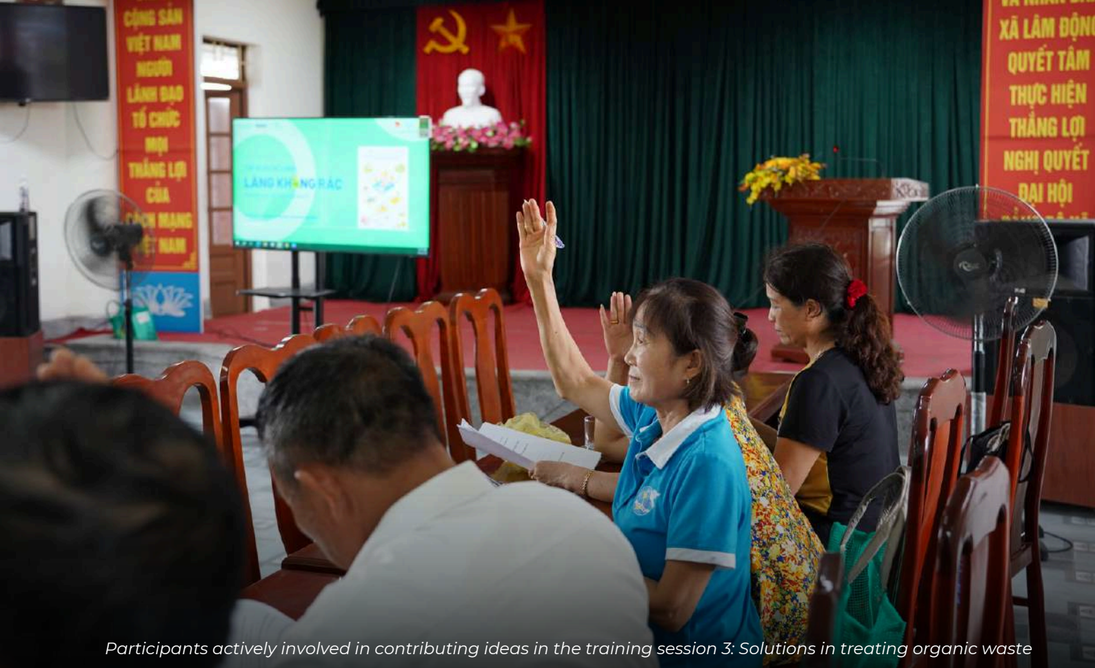
Participants actively involved in contributing ideas in the training session 3: Solutions in treating organic waste