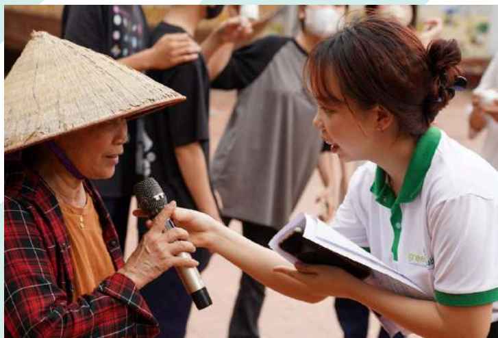
Participants received gifts of bio-enzymatic hand sanitizer after involved in activities to learn about the environment and waste.

During the event we hosted mural painting activities and discovery games to engage people on the the topics of domestic and plastic waste.