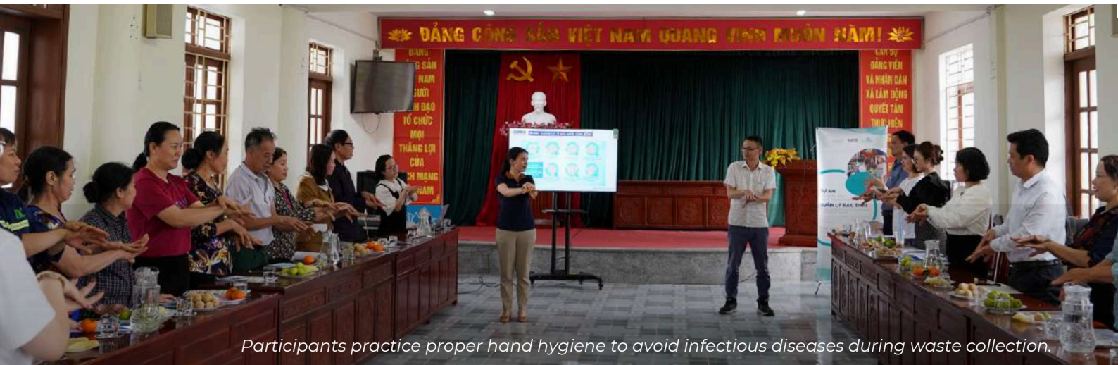
Participants practice proper hand hygiene to avoid infectious diseases during waste collection.

On March 29, 2024, we held our "Safety in domestic solid waste classification and collection at source" training in Lam Dong commune with the participation of nearly 20 members, including representatives of Hai Phong Department of Natural Resources and Environment, Lam Dong Commune People's Committee, DSCS, Unions, local waste collection workers and GreenHub.