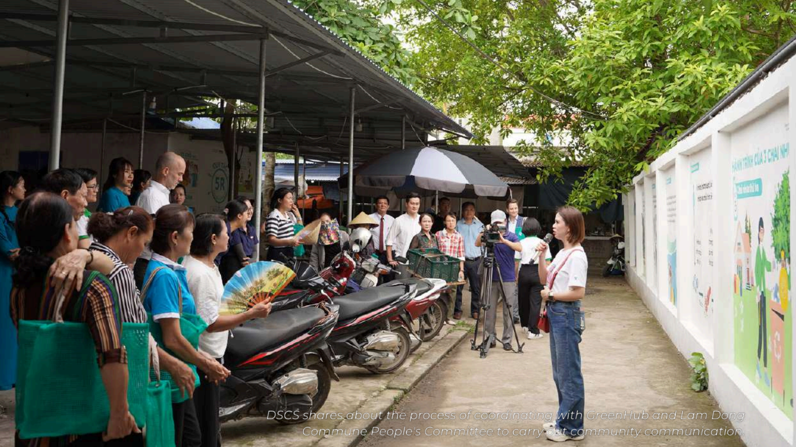
DSCS shares about the process of coordinating with GreenHub and Lam Dong Commune People's Committee to carry out community communication.