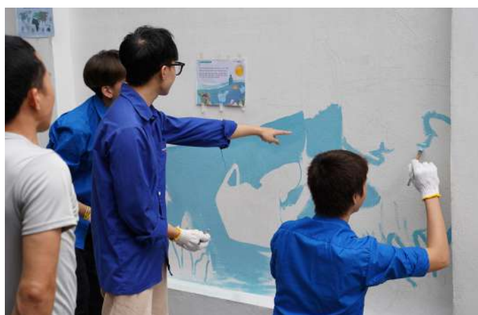
A group of student volunteers from Vietnam Maritime University participating in a mural painting activity