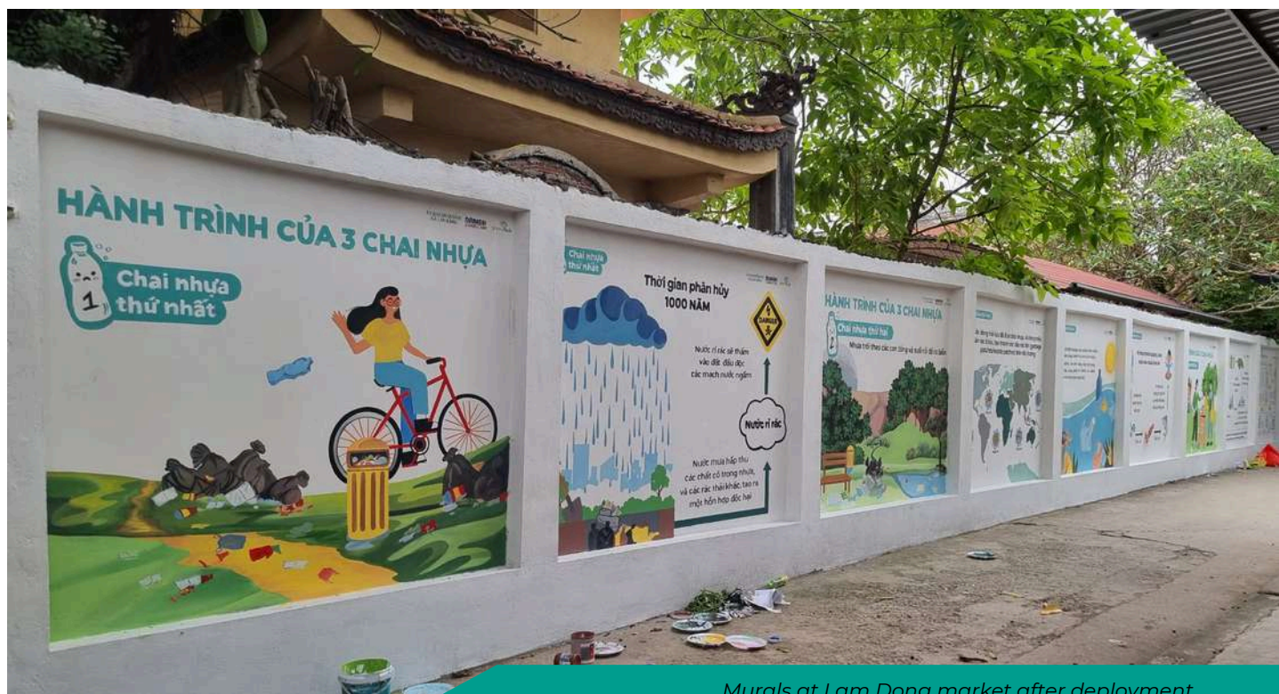
Murals at Lam Dong market after deployment

On April 20-21, 2024, representatives of the local government and associations of Lam Dong commune, DSCS, GreenHub, a volunteer student team of Vietnam Maritime University and a group of small businesses at Lam Dong market carried out the artistic activity "Painting murals to promote environmental protection", giving a new look to Lam Dong market. This activity is a testament to the efforts of cooperation, mobilizing the participation of the government - businesses and the community to raise awareness and change people's environmental protection behavior.