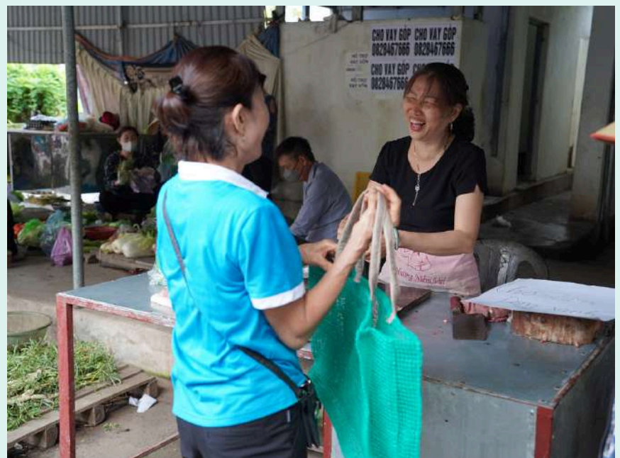
Women's Union members and traders at the market explore solutions together to limit the use of plastic bags

Within the framework of implementing the model, the project donated shopping bags recycled from old fishing nets to replace plastic bags for small business representatives and customers at Lam Dong market. The continuation of this practical activity will contribute to reducing the use of plastic bags and is a key first step in building the model "Lam Dong Market restricts the use of plastic bags".