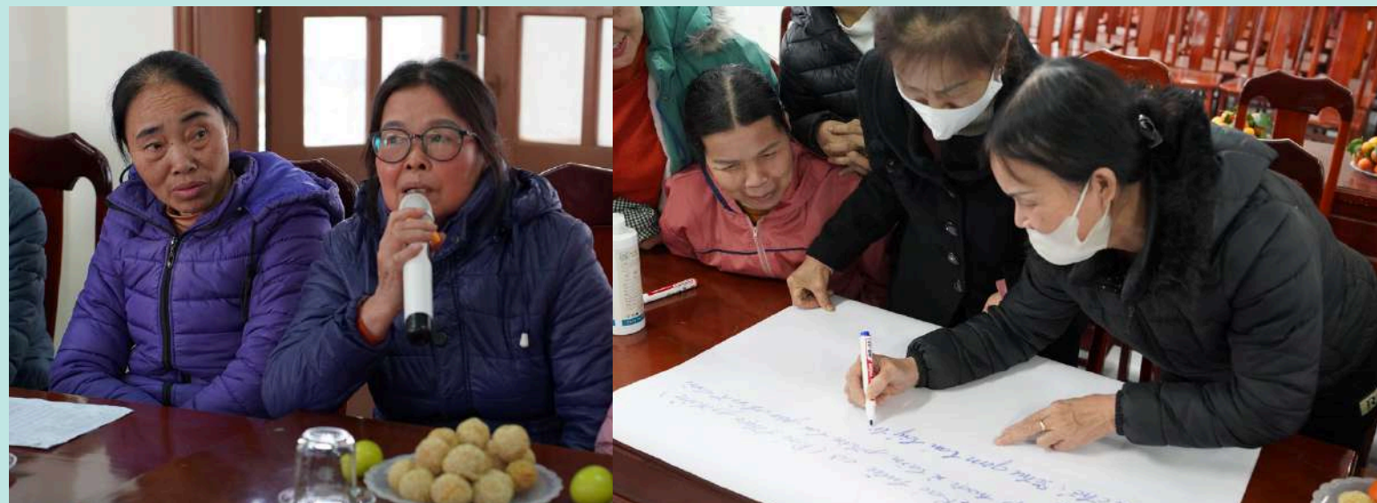
Key residents of four villages were discussing in groups and sharing local waste issues

Group discussion, information exchanges and sharing activities were interwoven into the training to engage participants and empower each household to find solutions to improve the environment at home and in their community.