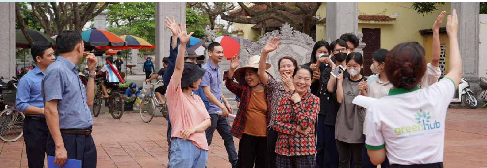
Participants actively involved in activities to learn knowledge about the environment and domestic waste.

On April 21, 2024, Lam Dong Commune People's Committee coordinated with GreenHub and DSCS to organize an event to support the Earth Day April 22 to raise awareness of the value of the natural environment, as well as explore the current waste situation and solutions to reduce plastic.