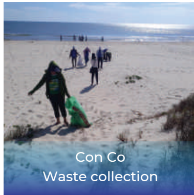
Con Co Waste collection