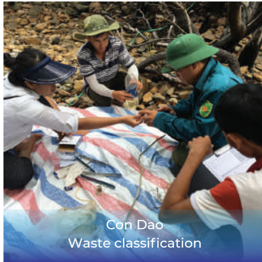
Con Dao Waste classification