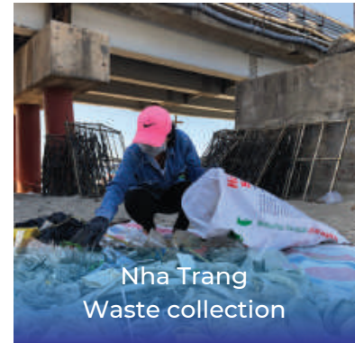
Nha Trang Waste collection