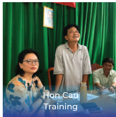
Hon Cau Training