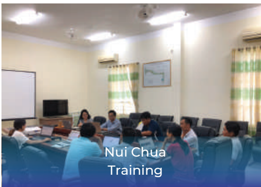
Nui Chua Training