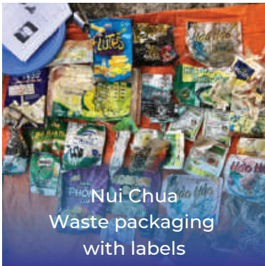
Nui Chua Waste packaging with labels