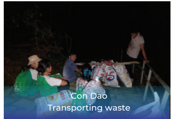
Con Dao Transporting waste