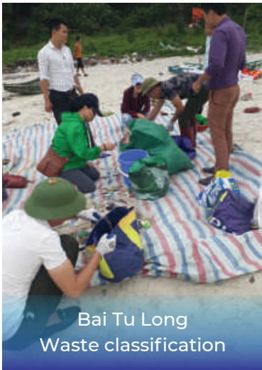
Bai Tu Long Waste classification