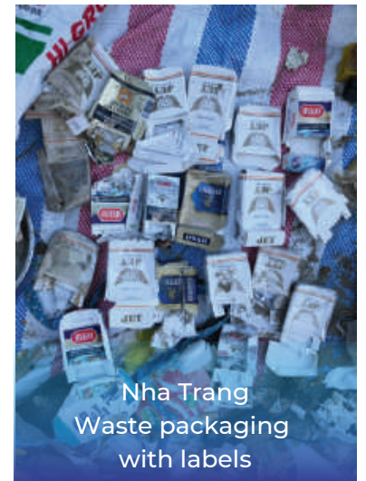
Nha Trang Waste packaging with labels